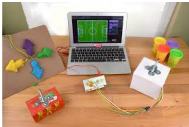
Makey Makey device connected to colored clay