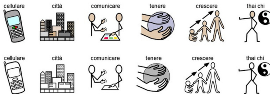
Augmentative and alternative communication used in software SymWriter

https://sd2.itd.cnr.it/index.php?r=site/scheda&id=5751